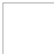
BRSP BASE RUBBER SHOCK PAD (3MM BASE RUBBER SHOCK PAD)

NOTES: ALL DIMENSIONS IN MILLIMETRES UNLESS OTHERWISE SPECIFIED A3 PRINT MATERIAL: Drawing may not be to scale. If you require manufacturer information please contact Ryno.