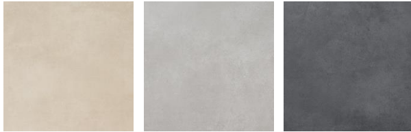
Crema Beige Argento Grey Nero Anthracite

Please note: Colour shades may differ between batches. If you need a specific batch to match a previous order for a project, please inform us when placing your order, although availability can't be guaranteed.