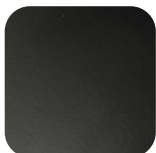
Classic Colour Finish Black Grey