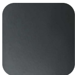
Classic Colour Finish Anthracite Grey