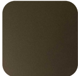
Metallic Finish Dark Metallic Bronze Coating