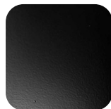
Classic Colour Finish Jet Black