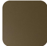
Metallic Finish Mid Metallic Bronze Coating