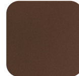
Metallic Finish Corten Metallic Coating