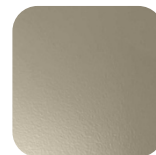
Classic Colour Finish Pebble Grey