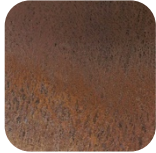
Steel Finish Corten Steel