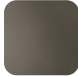
Steel Finish Blackened Steel